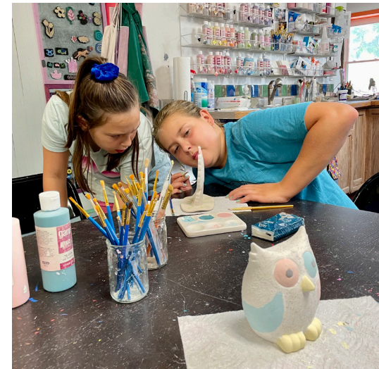
Guttenberg Gallery & Creativity Center